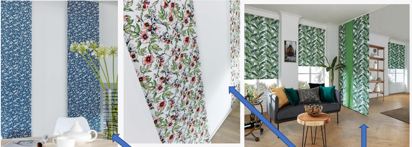
Check out these Panel Glides in "Meadow - Nightingale", or maybe the "Wildflower - Porcelain" or how about the Panel-Glide/Roller combo in "Palm Leaf - Carnival Chive!!"

The new collection will be going live on 1 st June. But... we have a few pre-release photos for you! (Don't mean to brag but the guys at Louvolite absolutely love us!! They're constantly saying how much they want to give us big, cuddly hugs, particularly around the jugular. Aren't they sweet!?!)