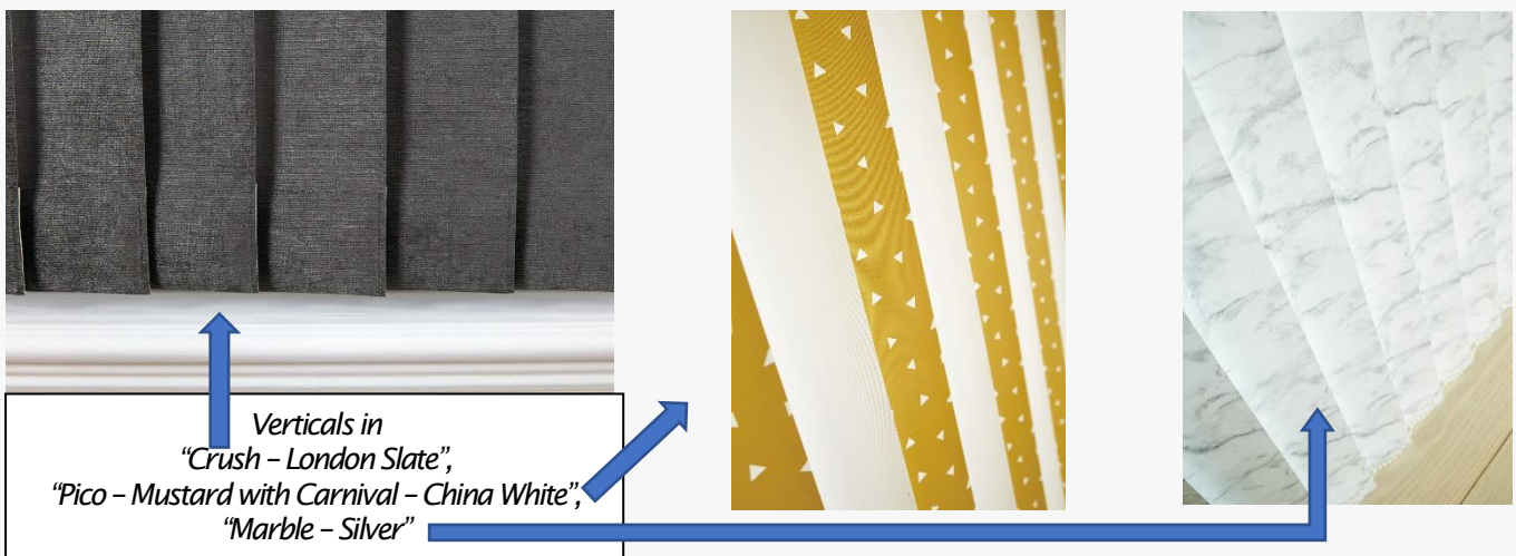
Verticals in "Crush - London Slate", "Pico - Mustard with Carnival - China White", "Marble - Silver"